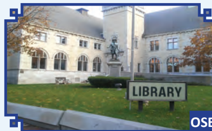
OTTAWA STREET BRANCH-OSB

Free parking is available at both locations. At OSB, parking can be validated at the Circulation desk when parking in the garage located at 110 N. Ottawa Street. Parking is FREE in downtown Joliet for two hours in certain zones and all day Sat./Sun.