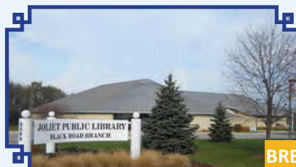
BLACK ROAD BRANCH-BRB