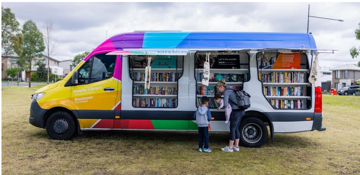
Exterior pop-up doors

4.1.1.4. Final design of this system shall be subject to library approval prior to installation.