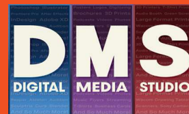
Photo Club R

(Ages 16+) Photographers of all levels, check out our Photo Club! This group meets every month to share, learn and network with other creatives. The group will do outings, meetups, shoot in the green screen room and share their techniques.